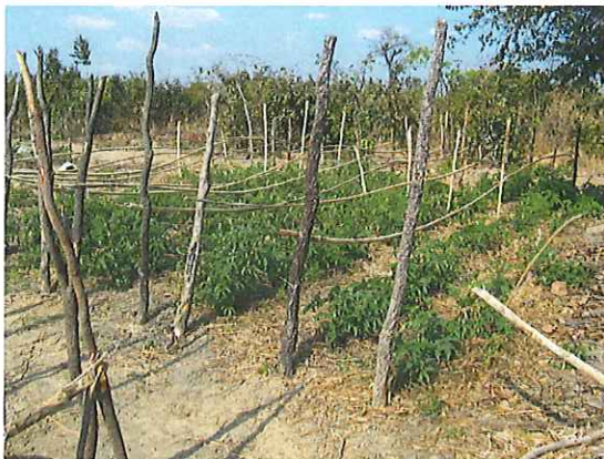
There is a larger agricultural plot this year - boasting tomatoes; carrots and potatoes which will be used in the school meals