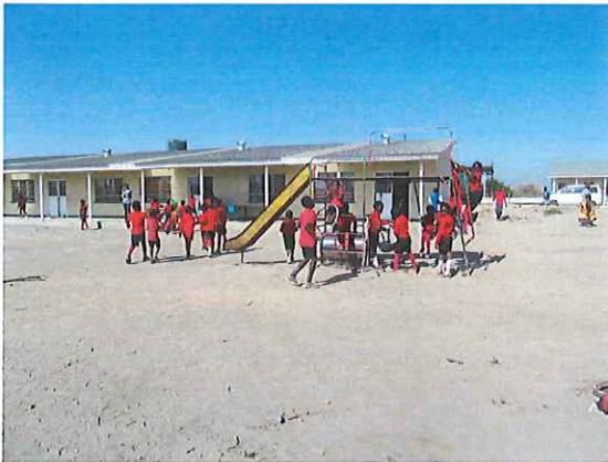
'School Playground' - there are plans to develop this playground over the next five years