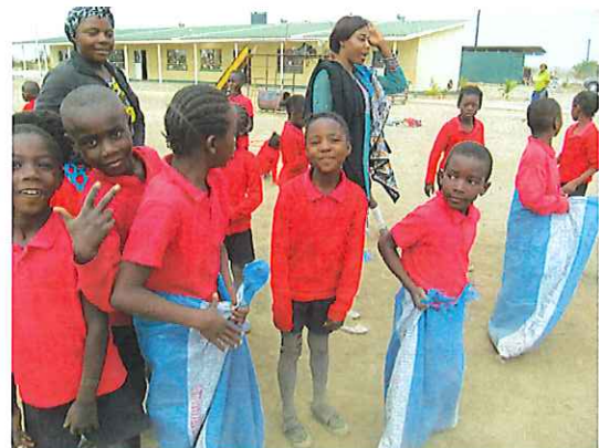
Children and family members having fun in the annual 'Sports Day'