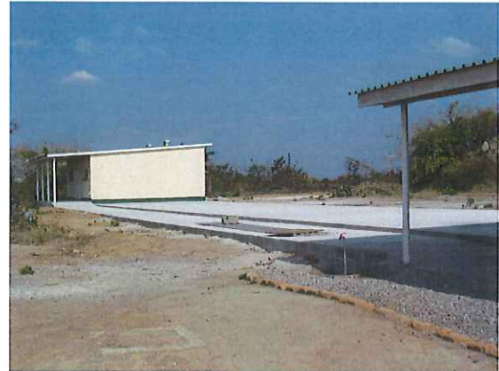
New toilet block and footings ready for a new classroom to be built